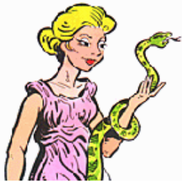
Hygeia, Goddess of Health , is the Greek goddess

Academic Calendar: http://www.deanza.edu/calendar/